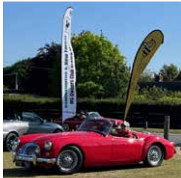
You drove for us