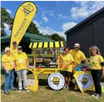
You volunteered for us

Thank you to everyone who got active, got creative, and helped to support us this year. These are just a few of the amazing things you did!