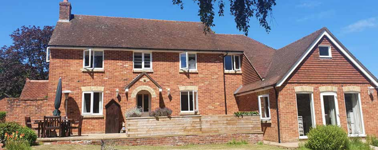
Honeypot House, Hampshire - opened in 1996