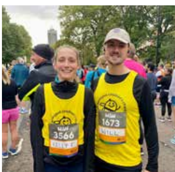
You ran for us