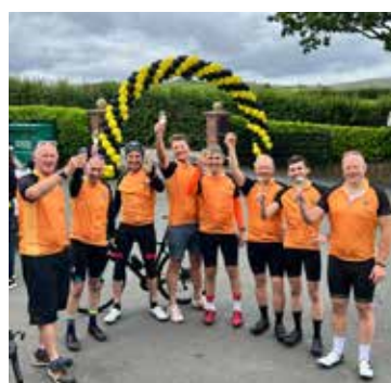
You cycled for us