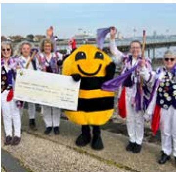
You danced for us