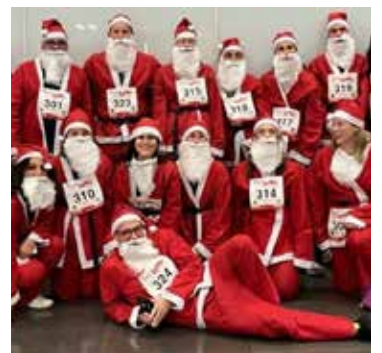
You dressed up for us