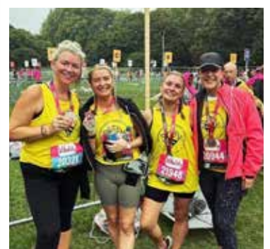
You walked for us