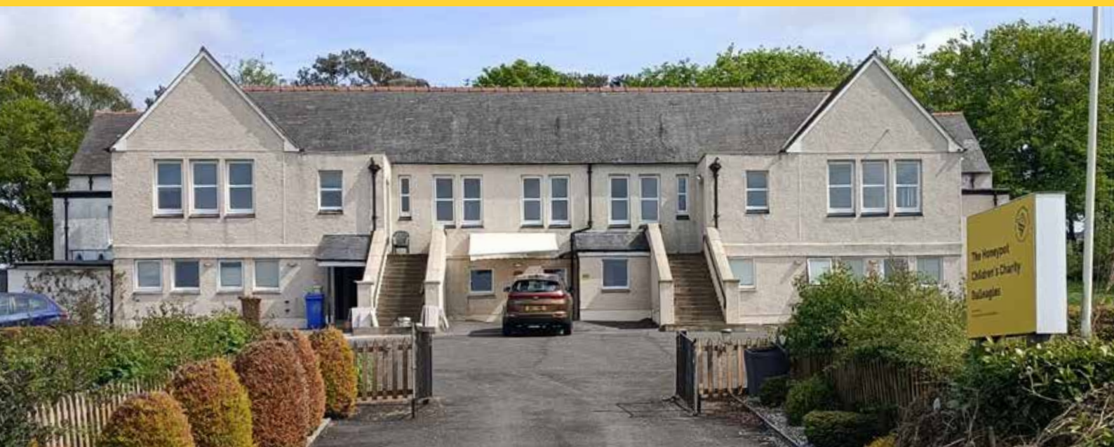
Honeypot Dalleagles, East Ayrshire - opened in 2023