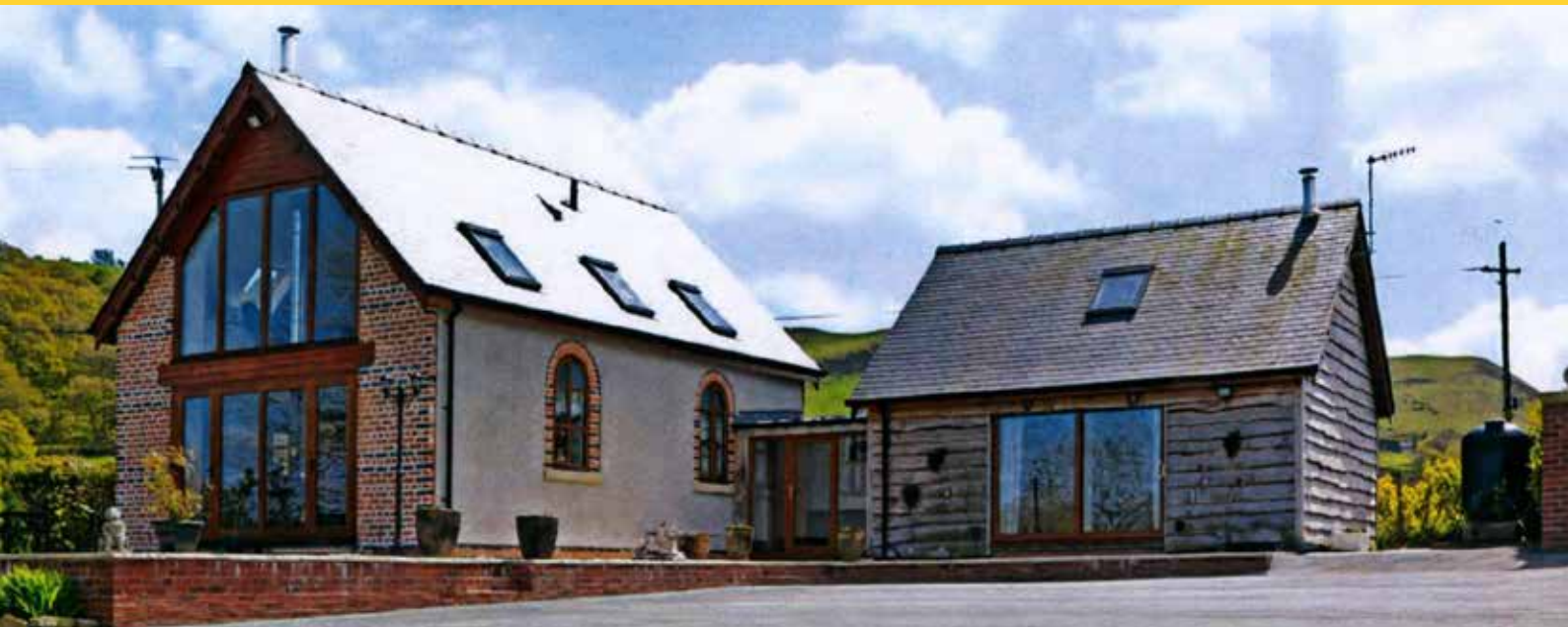
Honeypot Pen y Bryn, Powys - opened in 2016