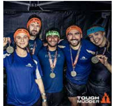
You got muddy for us