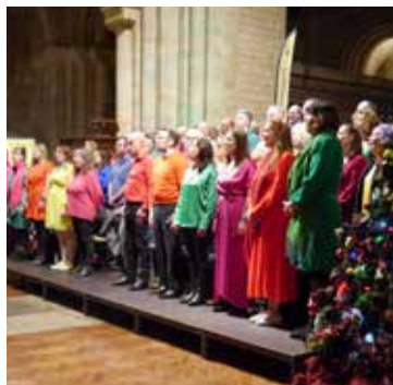
You sang for us